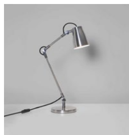
CODE: 1224001 FINISH: POLISHED ALUMINIUM