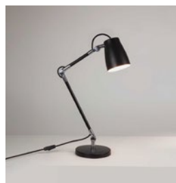
CODE: 1224003 FINISH: MATT BLACK

TO MAINTAIN THIS PRODUCT TO ITS BEST CONDITION, PLEASE VIEW OUR CARE AND CLEANING GUIDE ON THE SUPPORT SECTION OF THE ASTRO WEBSITE.