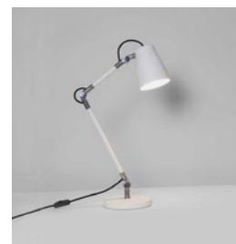
CODE: 1224002 FINISH: MATT WHITE