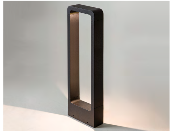
CODE: 1357006 (8005) FINISH: TEXTURED BLACK

THIS PRODUCT IS NOT SUITABLE FOR INSTALLATION WITHIN FIVE MILES OF THE COAST. FOR THESE ENVIRONMENTS, PLEASE FILTER PRODUCTS ON THE ASTRO WEBSITE BY 'COASTAL'.