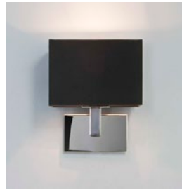
CODE: 1099003 (0567) FINISH: POLISHED CHROME