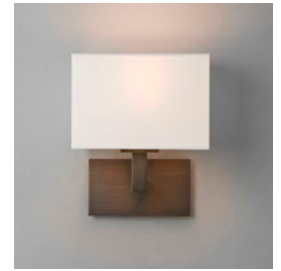
CODE: 199004 (8214) FINISH: BRONZE

TO MAINTAIN THIS PRODUCT TO ITS BEST CONDITION, PLEASE VIEW OUR CARE AND CLEANING GUIDE ON THE SUPPORT SECTION OF THE ASTRO WEBSITE.