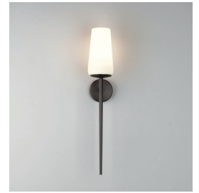
CODE: 1388003 + 5033005 FINISH: BRONZE

TO MAINTAIN THIS PRODUCT TO ITS BEST CONDITION, PLEASE VIEW OUR CARE AND CLEANING GUIDE ON THE SUPPORT SECTION OF THE ASTRO WEBSITE.