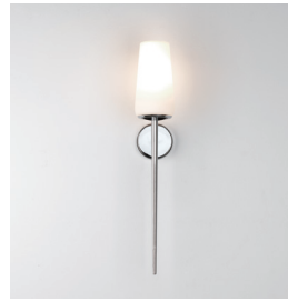
CODE: 1388001 + 5033005 FINISH: POLISHED CHROME