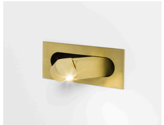
CODE: 1323007 FINISH: MATT GOLD

TO MAINTAIN THIS PRODUCT TO ITS BEST CONDITION, PLEASE VIEW OUR CARE AND CLEANING GUIDE ON THE SUPPORT SECTION OF THE ASTRO WEBSITE.