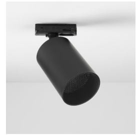
CODE: 1396004 FINISH: MATT BLACK

TO MAINTAIN THIS PRODUCT TO ITS BEST CONDITION, PLEASE VIEW OUR CARE AND CLEANING GUIDE ON THE SUPPORT SECTION OF THE ASTRO WEBSITE.