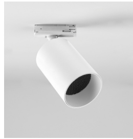
CODE: 1396003 FINISH: MATT WHITE