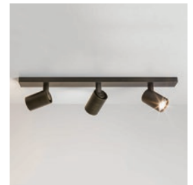
CODE: 1286006 FINISH: BRONZE