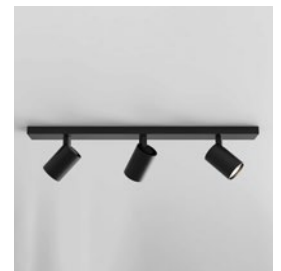
CODE: 1286083 FINISH: MATT BLACK

TO MAINTAIN THIS PRODUCT TO ITS BEST CONDITION, PLEASE VIEW OUR CARE AND CLEANING GUIDE ON THE SUPPORT SECTION OF THE ASTRO WEBSITE.