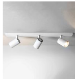
CODE: 1286003 FINISH: TEXTURED WHITE