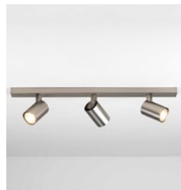
CODE: 1286013 FINISH: MATT NICKEL