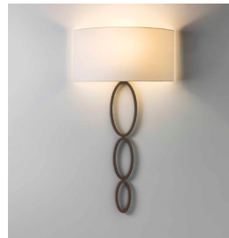
CODE: 1356007 (8261) FINISH: BRONZE

TO MAINTAIN THIS PRODUCT TO ITS BEST CONDITION, PLEASE VIEW OUR CARE AND CLEANING GUIDE ON THE SUPPORT SECTION OF THE ASTRO WEBSITE.