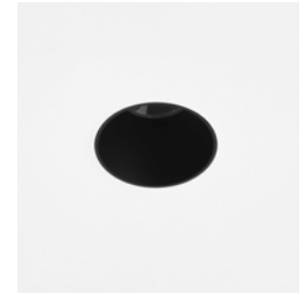
CODE: 1392018 FINISH: MATT BLACK

TO MAINTAIN THIS PRODUCT TO ITS BEST CONDITION, PLEASE VIEW OUR CARE AND CLEANING GUIDE ON THE SUPPORT SECTION OF THE ASTRO WEBSITE.