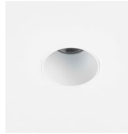
CODE: 1392017 FINISH: MATT WHITE