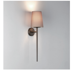
CODE: 1388003 + 5033003 FINISH: BRONZE

TO MAINTAIN THIS PRODUCT TO ITS BEST CONDITION, PLEASE VIEW OUR CARE AND CLEANING GUIDE ON THE SUPPORT SECTION OF THE ASTRO WEBSITE.