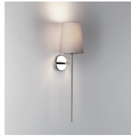
CODE: 1388001 + 5033002 FINISH: POLISHED CHROME