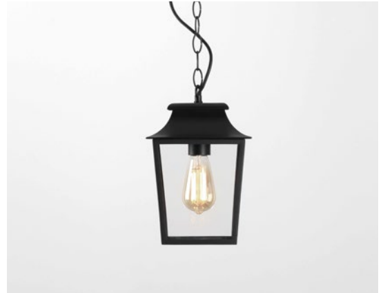
CODE: 1340008 FINISH: TEXTURED BLACK

TO MAINTAIN THIS PRODUCT TO ITS BEST CONDITION, PLEASE VIEW OUR CARE AND CLEANING GUIDE ON THE SUPPORT SECTION OF THE ASTRO WEBSITE.