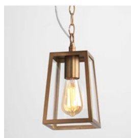
CODE: 1306006 FINISH: ANTIQUE BRASS

THIS PRODUCT IS NOT SUITABLE FOR INSTALLATION WITHIN FIVE MILES OF THE COAST. FOR THESE ENVIRONMENTS, PLEASE FILTER PRODUCTS ON THE ASTRO WEBSITE BY 'COASTAL'.