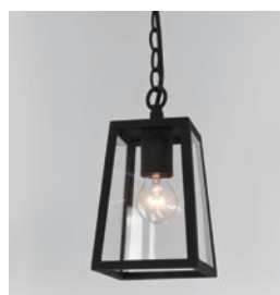
CODE: 1306003 FINISH: TEXTURED BLACK