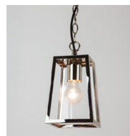
CODE: 1306004 FINISH: POLISHED NICKEL