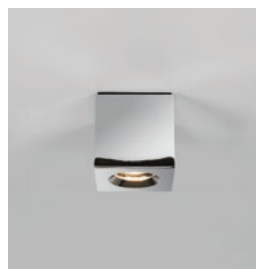
CODE: 1326005 FINISH: POLISHED CHROME