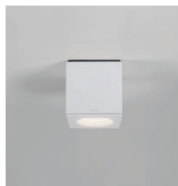
CODE: 1326008 FINISH: TEXTURED WHITE