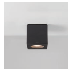
CODE: 1326007 FINISH: TEXTURED BLACK