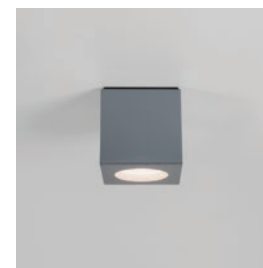
CODE: 1326013 FINISH: TEXTURED GREY

TO MAINTAIN THIS PRODUCT TO ITS BEST CONDITION, PLEASE VIEW OUR CARE AND CLEANING GUIDE ON THE SUPPORT SECTION OF THE ASTRO WEBSITE.