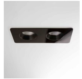
CODE: 1254018 FINISH: BLACK

TO MAINTAIN THIS PRODUCT TO ITS BEST CONDITION, PLEASE VIEW OUR CARE AND CLEANING GUIDE ON THE SUPPORT SECTION OF THE ASTRO WEBSITE.