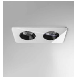
CODE: 1254015 FINISH: WHITE