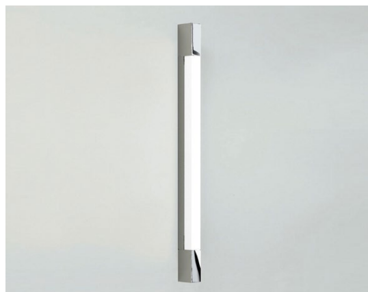
CODE: 1150001 FINISH: POLISHED CHROME

TO MAINTAIN THIS PRODUCT TO ITS BEST CONDITION, PLEASE VIEW OUR CARE AND CLEANING GUIDE ON THE SUPPORT SECTION OF THE ASTRO WEBSITE.