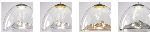
CS / CR Crystal / chrome CS / OR Crystal / gold AM / OR Amber / gold GR / CR Grey / chrome

Considering the craftsmanlike manufacturing of the product and the special finishing process, always by hand, you may find different appearances and shades between one product and another and they are to consider as absolute distinction of the item.